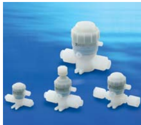
■ Air operated chemical valve/Non-metallic exterior Type: LVQ