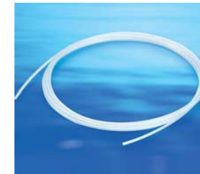
■ High purity fluoropolymer/Tubing Type: TL/TIL