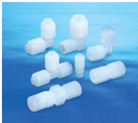
■ High purity fluoropolymer/Fittings Type: LQ1