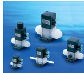
■ High purity chemical valve/Compact Type: LVD