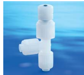
■ High purity fluoropolymer/Needle valve Type: LVN