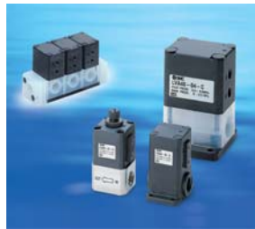
■ High purity chemical valve/Threaded Type: LVA