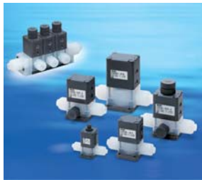
■ High purity chemical valve/Integrated fitting Type: LVC