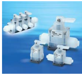
■ High purity chemical valve/Manually operated Type: LVH